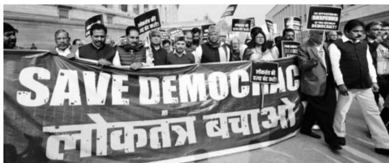
Leader of Opposition in Rajya Sabha Mallikarjun Kharge (centre) with suspended opposition MPs at a protest on Thursday

In a reference to the mimicry issue and Rajya Sabha Chairman Jagdeep Dhankhar's remarks on it, Kharge said, "I am sorry to say that the Rajya Sabha Chairman has in a way brought casteism to Parliament by raising an